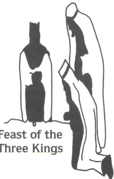
Feast of the Three Kings