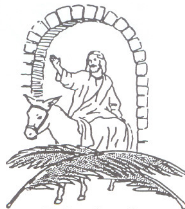
Palm Sunday April 4, 2004

Sunday, April 18, 2004, following Morning Worship. The meeting will be preceded by a catered luncheon provided by the Vestry. All heads of departments, treasurers and committee chairmen should be prepared to give reports.