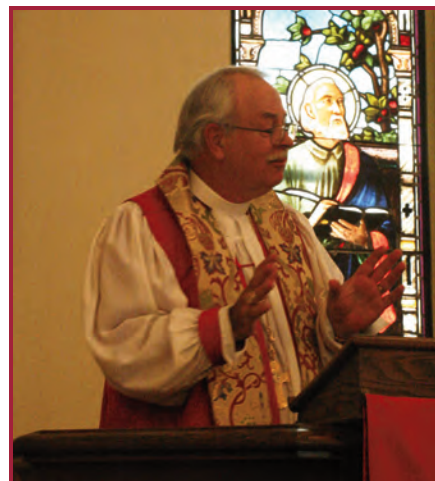
Bishop Grote Preaching