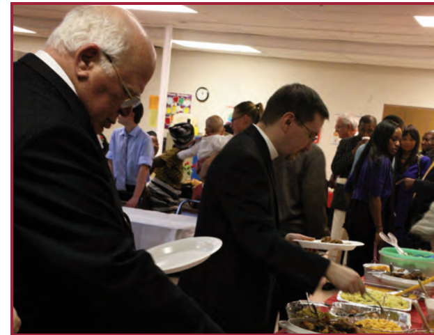
Time to Eat