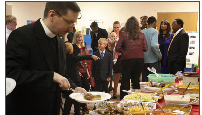
So many delicious food dishes.