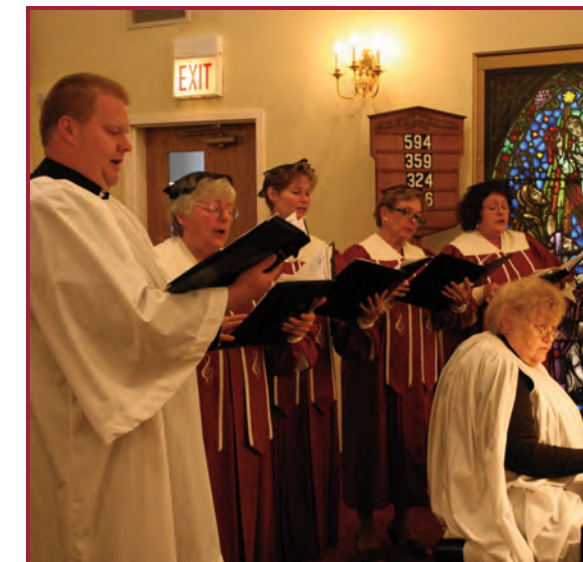
The Choir singing