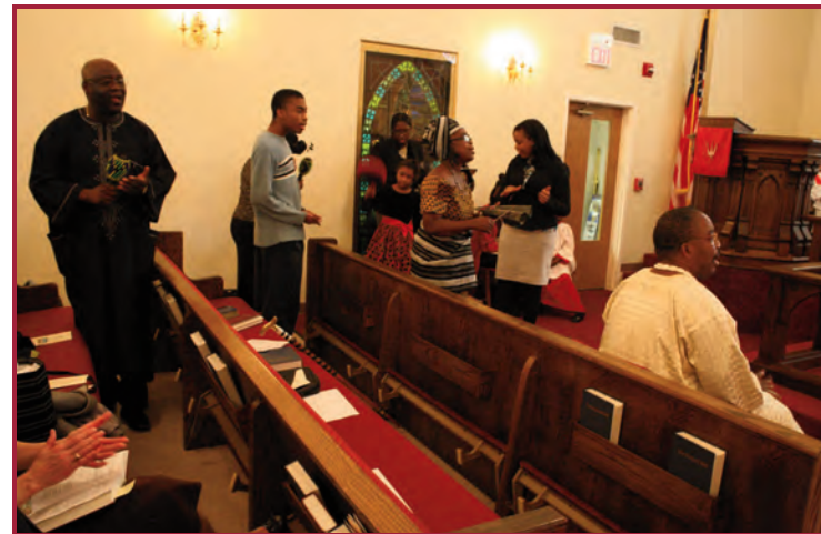
Some members of All Saints' singing during the service.